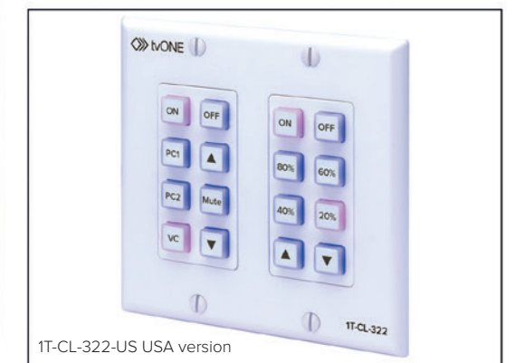
1T-CL-322-US USA version