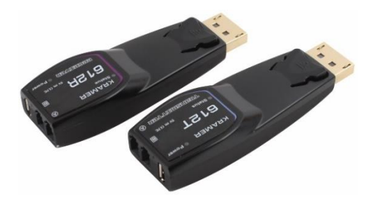
Figure 1: 612T Transmitter and 612R Receiver

Congratulations on purchasing your Kramer 612T and 612R Plug and Play active 4K60 4:4:4 DP Tx/Rx over Extended-Reach Multi-Mode (MM) Fiber Optic cable. 612T and 612R extend signals of up to 4096x2160 @60Hz, over a distance of up to 200m (656ft) without signal scaling or data compression, providing a maximum data rate of 21.6Gbps (5.4Gbps per lane). 612T and 612R are easily and securely connected via a 2LC fiber connector and can be powered either from the USB connector or from the DisplayPort interface (pin #20).