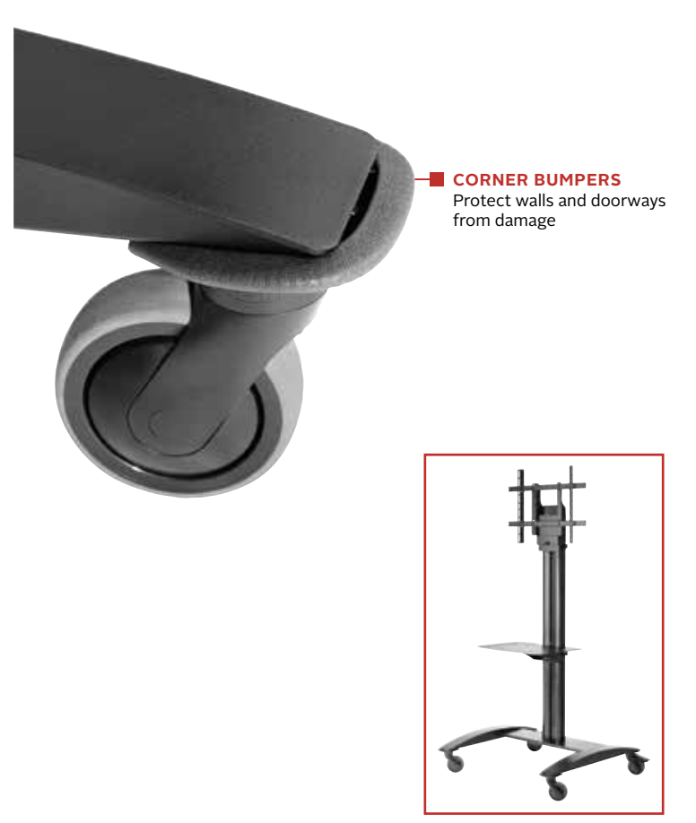
For use with Peerless-AV® SR carts