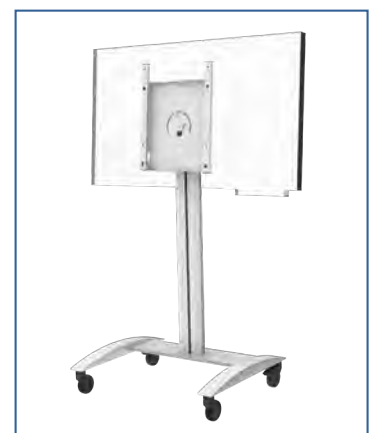
Shown with SR560-FLIP Mobile Cart with Rotational Interface (sold separately)