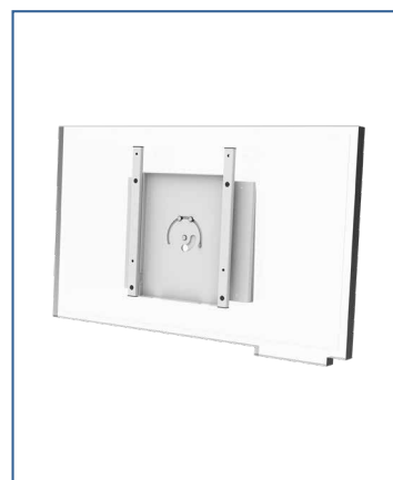
Shown with RM13-FLIP Rotational Wall Mount (sold separately)

MOUNT COMPATIBILITY Attaches to SR560-FLIP Mobile Cart with Rotational Interface and RM13-FLIP Rotational Wall Mount