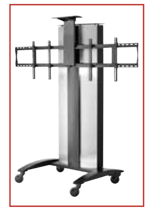
For use with SmartMount® SR555E and SR575E video conferencing carts