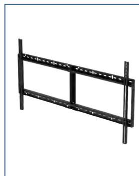
Compatible with Peerless-AV® Universal Flat Wall Mount (SF680-HUB)

Please visit peerless-av.com/en-us/patents for patent information.