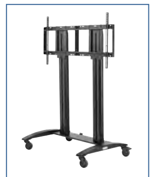
Compatible with Peerless-AV® SmartMount® Cart (SR598-HUB)