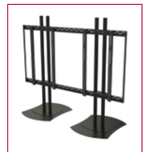
2x2 Video Wall Stand