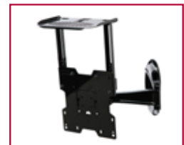
Shown attached to Peerless-AV SA740P mount