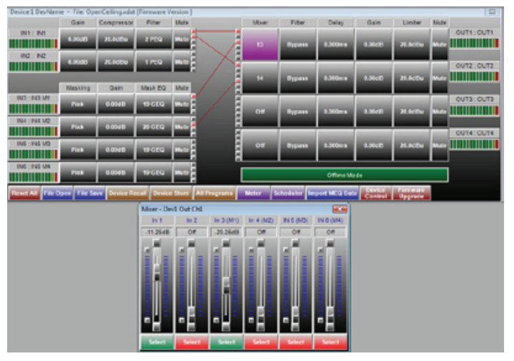
Output Matrix Mixer Screen

be accomplished via control system interface (not included). The unit shall provide two balanced audio Mic / Line level inputs along with four independent internal digital white / pink noise generator inputs. The Mic / Line inputs shall provide 30 dB of gain. Each of the Mic / Line inputs shall have independent gain control, parametric filter, compressor limiter, and mute function. All inputs and outputs shall be provided on plug-in Euro style dockable connectors. The four independent assignable white / pink noise generators shall have a spectrum of 20 Hz - 20 kHz, precision low-pass filtering of ±3 dB per octave and an extended "non-apparent" repeat time of 200 minutes.