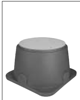
ATS100GL(8) landscape base shown with included yellow "under construction" base opening protector