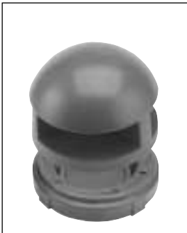
ATS183GS(8) surface mount base and speaker/transformer unit