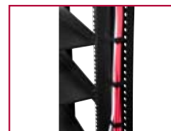
Internal cable management