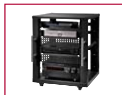
Accommodate most components

■ EASY MOBILITY Rubber wheels for easy movement from location to location