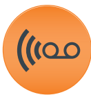
Recording and Streaming