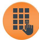
Video Telephony Services