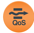
Bandwidth & QoS Management