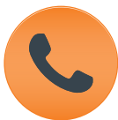
SIP & H.323 Control