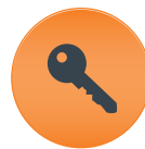
Management and Administration