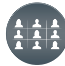
9-way Integrated MCU