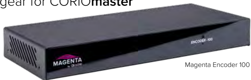
Magenta Encoder 100

You don't need to be a networking expert. Our Magenta Encoder 100 is automatically discovered and easily configured with CORIOmaster.