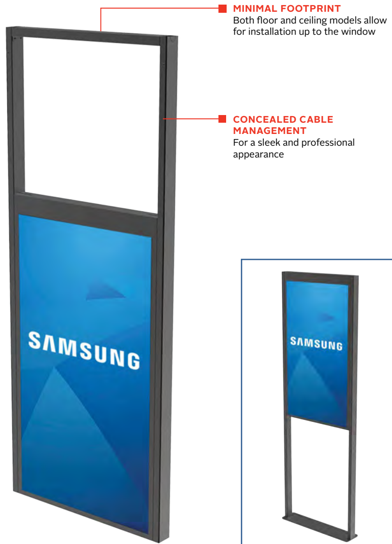
Ceiling Option Shown with Display (DS-OM46ND-CEIL/DS-OM55ND-CEIL)