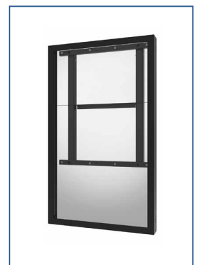
Portrait Orientation Available (EWP-OH85F)