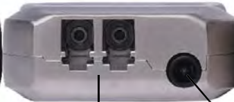
2 Strand LC-LC Fiber Optic Cable Input