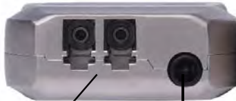
2 Strand LC-LC Fiber Optic Cable Input