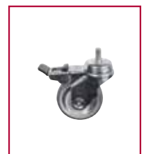
Accessory Caster (ACC332)