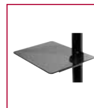
Accessory Shelf (ACC330)