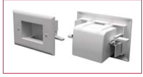
Wing design makes low voltage mounting brackets unnecessary

Routing low voltage cables inside the wall reduces clutter and eliminates need for external cable covers