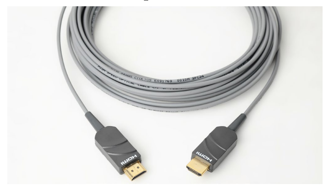
User Manual LHM2-Nxxx