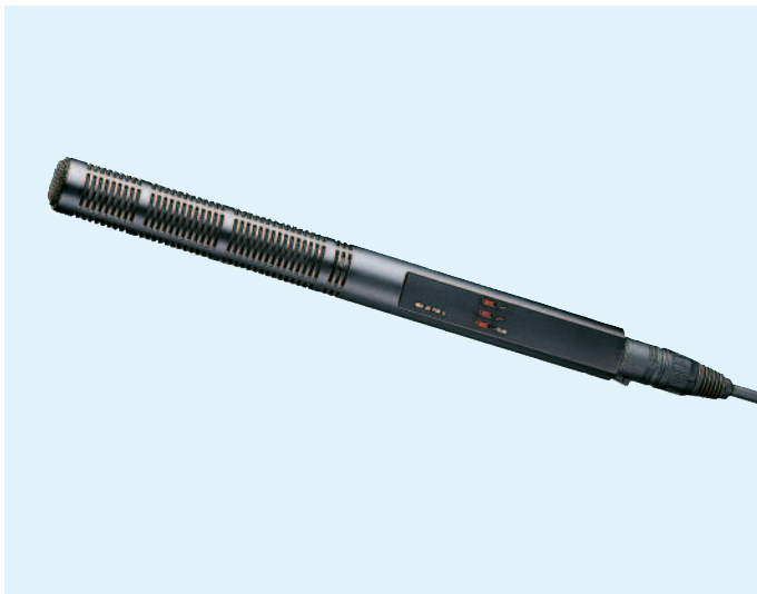
Cable pictured is an accessory not supplied with the microphone

The MKH 60 is a lightweight short gun microphone. It is versatile and easy to handle and its superb lateral sound muting makes it an excellent choice for film and reporting applications. Its high degree of directivity ensures high sound quality for distance applications.