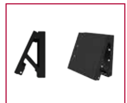
Prop-open service access

Prop-open mechanism provides quick service access to the media player without removing the display