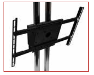
MOD-UNL2 with Dual-Pole Single Display Mount, MOD-FPMS2