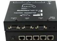
MultiView T5A Transmitter 400R3006