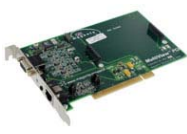
MultiView PCI Transmitter 4003246