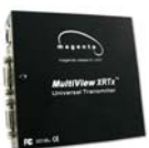
MultiView XRTx Transmitter 400R3588