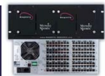
Mondo Matrix Cat5 Switch 16x16—256x512 221R3001