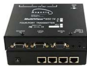
MultiView T4A Transmitter 400R2960