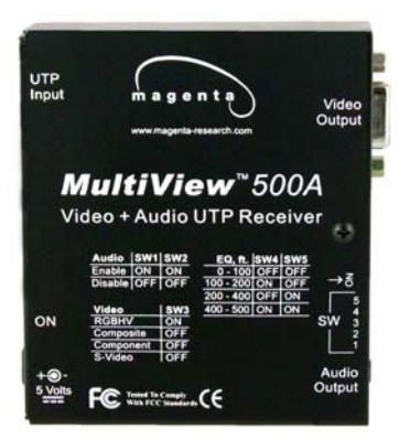
MultiView 500A Receiver 400R3540

User configurable, HD-ready receivers with options for video + audio or video + simplex/duplex RS-232