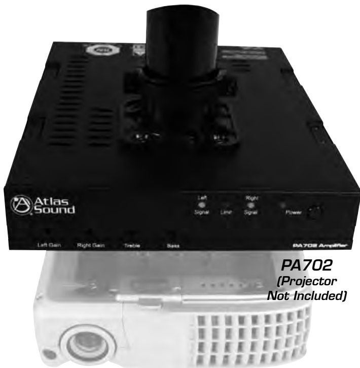
PA702 (Projector Not Included)

The slim profile chassis is also designed to work in a rack mount configuration. An optional rack mount kit allows single or dual mounting of the PA702 in a 1RU high configuration. (PA702-RMK)