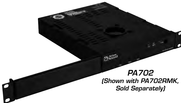
PA702 (Shown with PA702RMK, Sold Separately)

©2009 Atlas Sound L.P. All rights reserved. Atlas Sound and Strategy Series are trademarks of Atlas Sound L.P. All other trademarks are the property of their respective owners. AT5003692 RevA 10/09