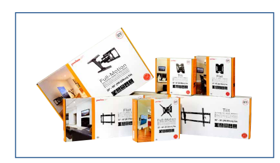
Comes in color packaging with included installation hardware and easy to follow instructions.

*This display size range is simply a guideline for product selection. Displays larger than the screen size range may still be compatible as long as they fall within the VESA® pattern and max weight of the Peerless-AV® product.