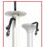
Internal cable management