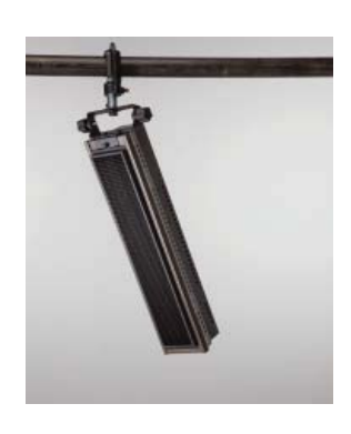
SeriesONE 1-lamp fixture; shown with vertical yoke configuration