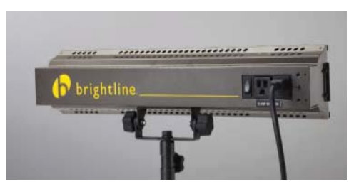
Rear of phase Dimmed Fixture showing Power In and Thru and On/Off Switch; Non-Dim similar.