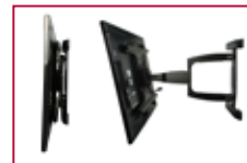
Arm retracts to just 2.60" (66mm) and extends up to 26.54" (674mm) from the wall