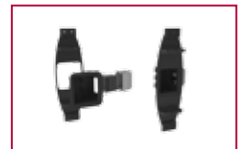
Optional Accessory ACCX400