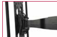
Up to 1" (25.4mm) of height adjustment