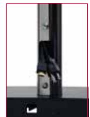
Internal cable management