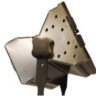
Profile of SeriesONE Fixture with Double Accessory Track