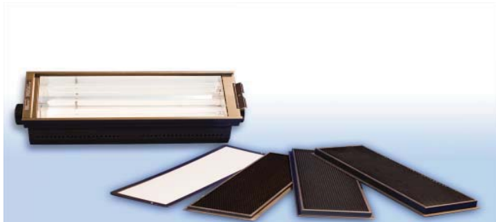
Accessories (for 2- and 4-lamp fixtures)