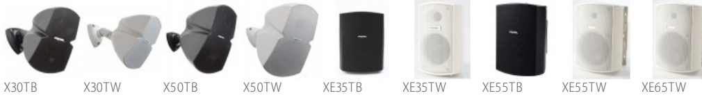
X30TB X30TW X50TB X50TW XE35TB XE35TW XE55TB XE55TW XE65TW

Technical specifications and appearances are subject to change without notice and accuracy is not guaranteed. All trademarks are the property of their respective owners. PROEL accepts no liability for any loss which may be suffered by any person who relies either wholly or in part upon any description, photograph or statement contained herein. Colors and specifications may vary from actual product. PROEL products are sold through authorized fullfillers and resellers only. This manual is copyrighter. No part of this manual may be reproduced or transmitted in any form or by any means, electronic or mechanical, including photocopying and recording of any kind, for any purpose, without the express written permission of PROEL - Via alla Ruenia 37/43 - CAP 64027 - Sant'Omero (TE) ITALY.