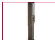
Safety Catch Mechanism