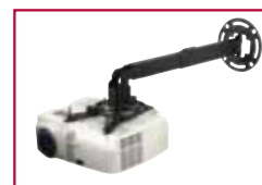
Wall Adapter Included with PPA & PPB